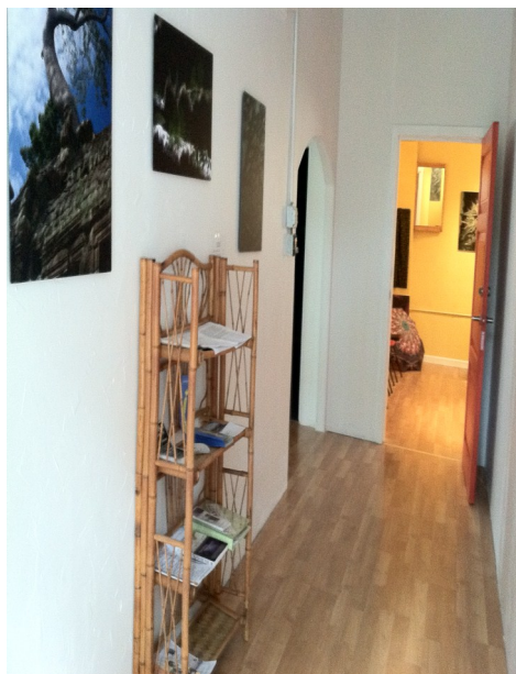
A Welcoming Entrance

Author of A People's History of the United States